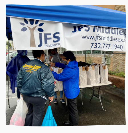
Community Outreach- food distribution to families in need