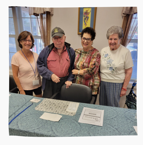
Congregate Meals- nourishing & engaging seniors