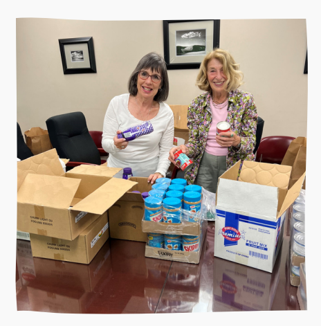
Volunteers pack food for JFS outreach events