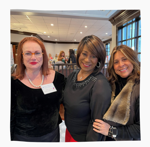
Networking in Middlesex County