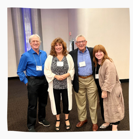
Staff, volunteers, and community partners at JFS Annual Meeting