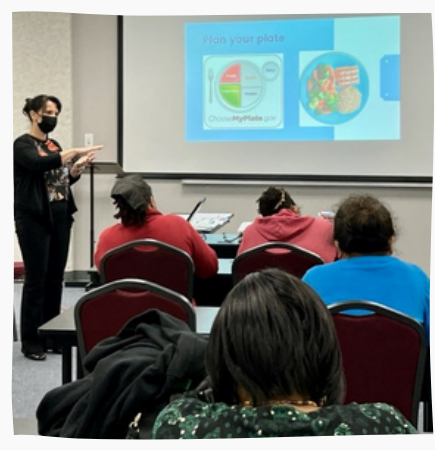
Women's Center- Learning about nutrious meal prep