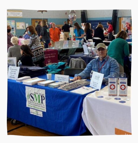
SMP- spreading the word on preventing Medicare fraud