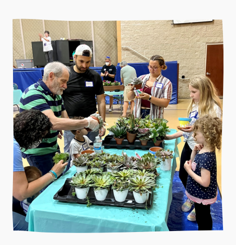
Mitzvah Day at Congregation B'nai Tikvah