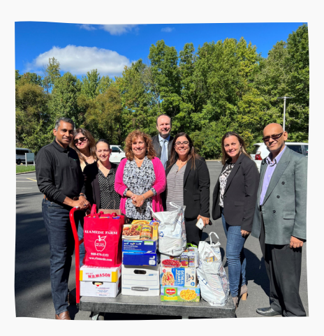
Kosher Food Pantries- Food donations from generous donors