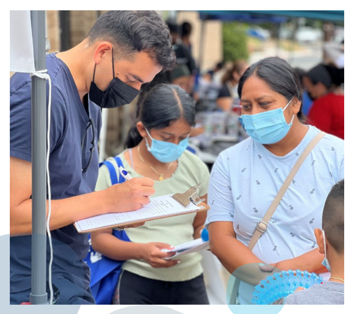
Volunteers help make outreach events a success!

We couldn't do it without your support--Thank You!