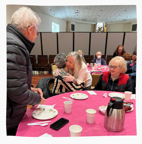
Café Europa hosts Holocaust Survivors in-person after 2 years