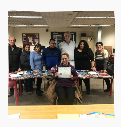
Citizenship Classes- supporting prospective U.S. citizens