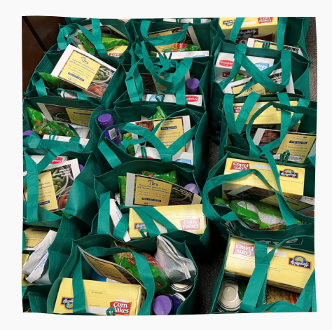
Hundreds of food bags distributed this year