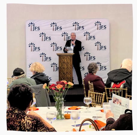
Volunteers honored at the JFS Annual Meeting