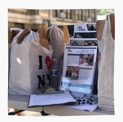
Community Outreach- showcasing JFS services and programs