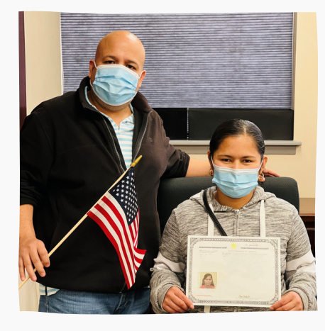
Citizenship Services- providing advocacy for complex cases