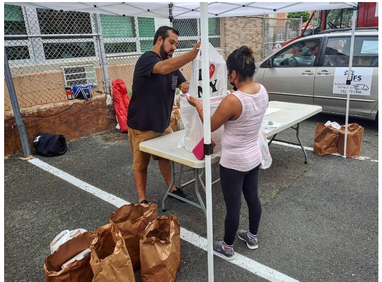
Nearly 100 families brought home shelf stable groceries from the JFS Food Pantry "On The Road" during the first collaboration event.