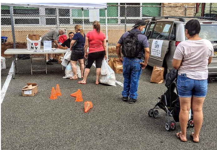
JFS aims to bring our Kosher Food Pantry to community centers where more people in need can access healthy food staples.

At JFS, we believe that adequate nutrition is foundational for all other success in life. To learn more about our kosher food pantries or to get involved, visit www.jfsmiddlesex.org .