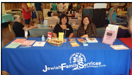
JFS On The Road : Rossmoor Health Fair, June 21, 2016

Pantry appointments; and functions as an Administrative Assistant registering clients, setting clinical appointments, covering the front desk and answering phones.